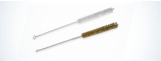
Aperture cleaning brushes

Aperture cleaning brushes with crimped wire or nylon for cleaning and deburring. Ideally suited for small pipes and tubes. Brush dia 4 to 30 mm.