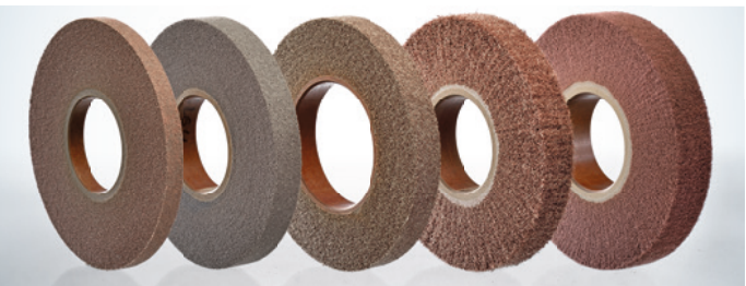
Non-woven Lipprite® flap wheels and Lipprox® convolute wheels

Non-woven Lipprite® flap wheels and Lipprox® convolute wheels can be supplied in diameters 100 – 500 mm in a full range of SiC and AlOx materials. Lipprite® and Lipprox® can be used on stationary, automatic or robotic machines, in both dry and wet operations. They are recommended for light deburring, satin finishing, cleaning and decorative surfaces.